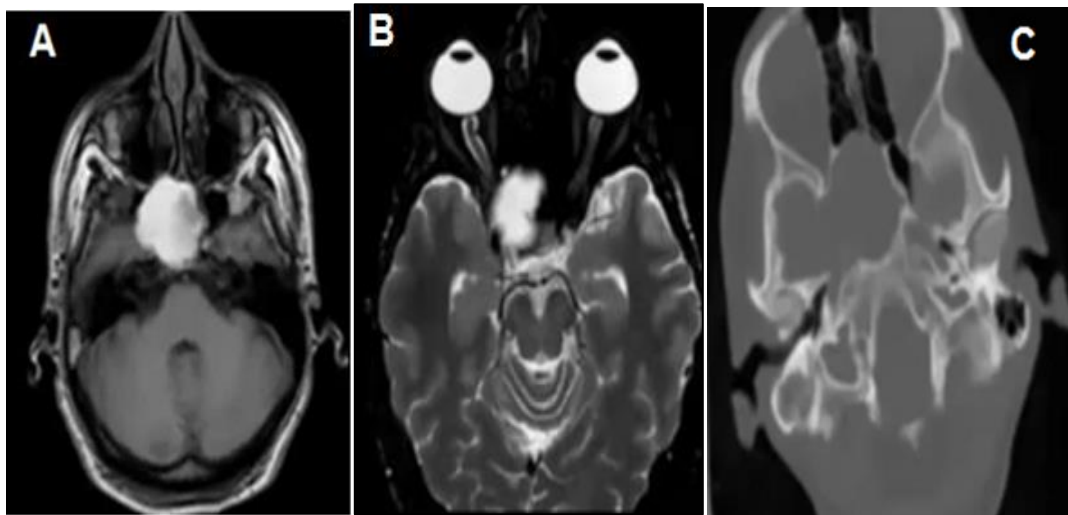
Fig (1): A female, 38 years old, with right-side papilledema A) An Axial T1 weighted image shows large mucocele in the right side of the sphenoid sinuses with high signal intensity. B) An MRI axial T2 SPIR image shows symmetry between the right and left perioptic nerve sheaths, indicating papilledema. C) An Axial CT image for the same patient shows the sphenoid sinuses mucocele with destruction and bone erosion

The MRI examination was done by lying the patients on the MRI table, with the head coil placed, and then protocols were used including different sequences: T1-axial (TR=400 ms, TE=8 ms), T2-axial (TR=3000 ms, TE=96 ms), sagittal T2, axial T2 Short Tau Inversion Recovery (STIR), axial T2-weighted Fluid-Attenuated Inversion Recovery (FLAIR), and Diffusion-Weighted Imaging (DWI). Standardized imaging parameters across all machines included a slice thickness of 3 mm, a field of view (FOV) of 230 mm, and 256 \times 256 matrix size. The radiographic images were confidentially evaluated by three radiologists with over 10 years of experience based on the shape of the sinus and the signal intensity during the examination. High resolution on T1 and T2 images indicated that mucocele had accumulated in the area. The bone condition was also evaluated to determine if there was erosion of the structure, which indicates advanced disease and increased pressure on intracranial structures. Neighbouring structures, such as the eye and cavernous sinus, were then evaluated to determine if the disease had progressed and penetrated into the adjacent structures as shown in Figure 1. The study was approved by the Training and Human Development Center at the Medical City, Ministry of Health, Baghdad, and all patients agreed to provide information about their disease, while keeping patients' information confidential.